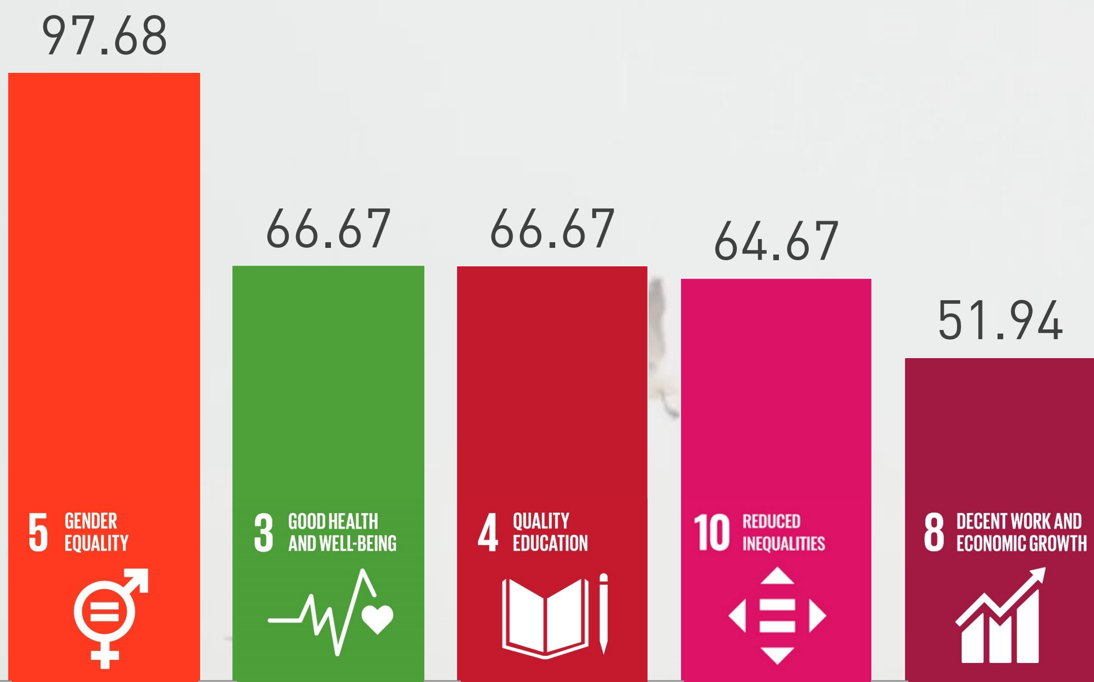
% of Excellence